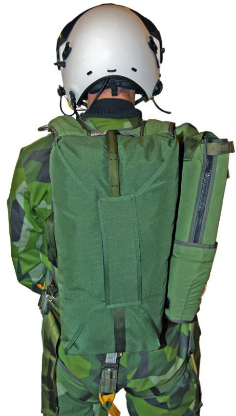
With parachute and PHAOS bottle attached